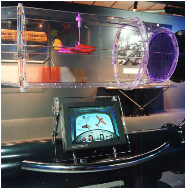
Computer based wind tunnel interactive