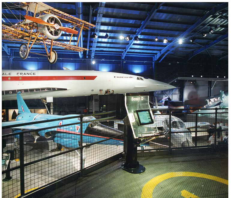
View from Mezzanine level